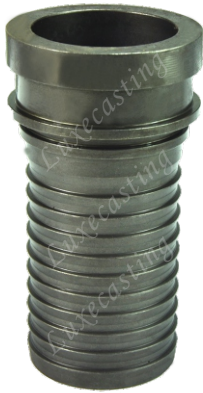
Concrete hose coupling